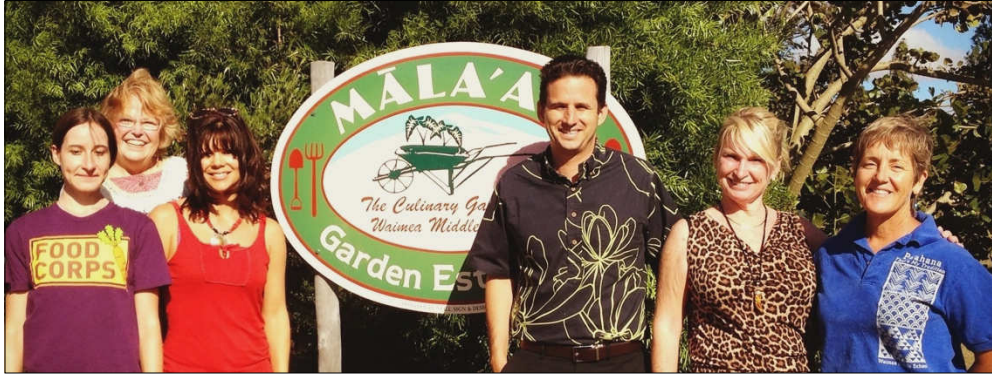
Mahalo, U.S. Senator Brian Schatz for Visiting Our School & Mala'ai Garden!

Keep Students & Families Healthy! Free Flu Clinic Family Permission Forms Due Friday, Sept. 6