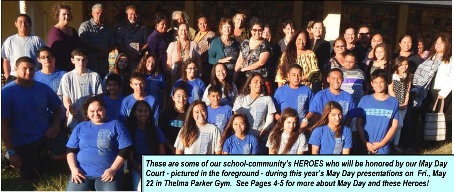
These are some of our school-community's HEROES who will be honored by our May Day Court - pictured in the foreground - during this year's May Day presentations on Fri., May 22 in Thelma Parker Gym. See Pages 4-5 for more about May Day and these Heroes!

Incoming 6th Grade Students & Families Invited To Orientation Tomorrow - Wed., May 6