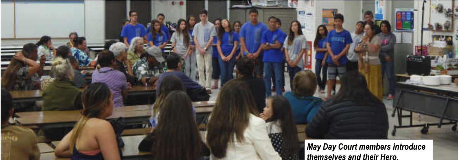
May Day Court members introduce themselves and their Hero.