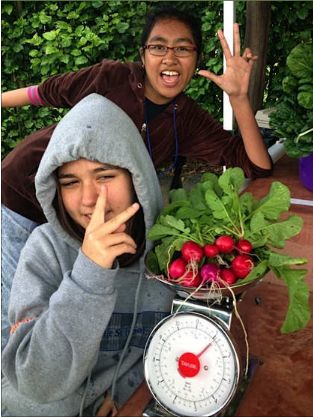
Students weigh and prep beautiful radishes and other veggies for our Wednesday Farm Stand! Mahalo to our students who have helped prepare for and manage the stand, and to families and community friends who have supported it!