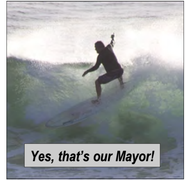
Yes, that's our Mayor!

It's all about: Doing Your Best and Being Your Best!