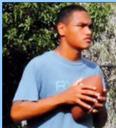
See more on Page 4.

In just 4 months, WMS students have made "tremendous growth" in math and reading this semester, according to just-completed Star assessments!