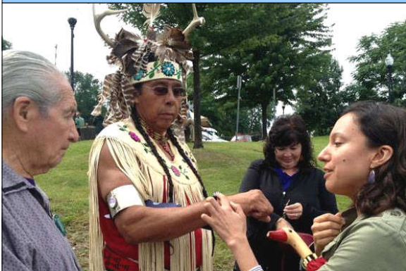
WMS student adornments are presented to Unity Riders from the Dakota Nation in NYC. For more pictures and the complete story, go to the 'Ike Hawai'i page at: www.WaimeaMiddleSchool.org

NOTE: All menus are posted on the school website.