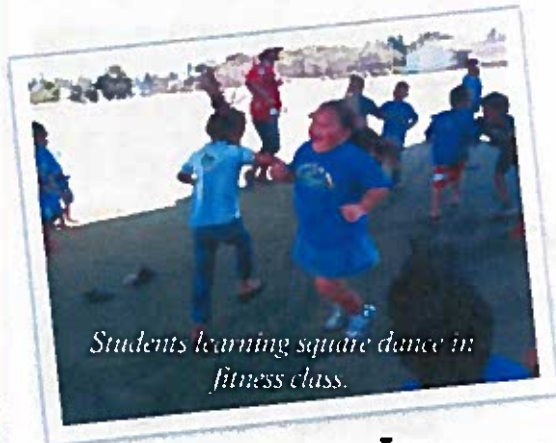
Students learning square dance in fitness class.

Language and Culture, Tutoring, E Ho'oulu Kakou (farming).