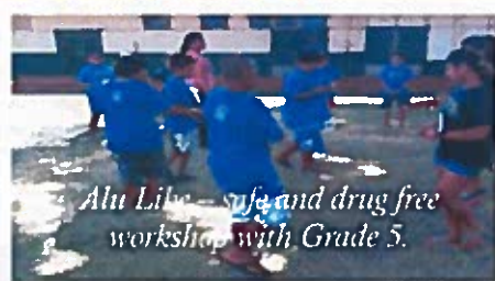
Alu Like - safe and drug free workshop with Grade 5.

Check out our new website at www.kualapuu.k12.hi.us and like us on Facebook.