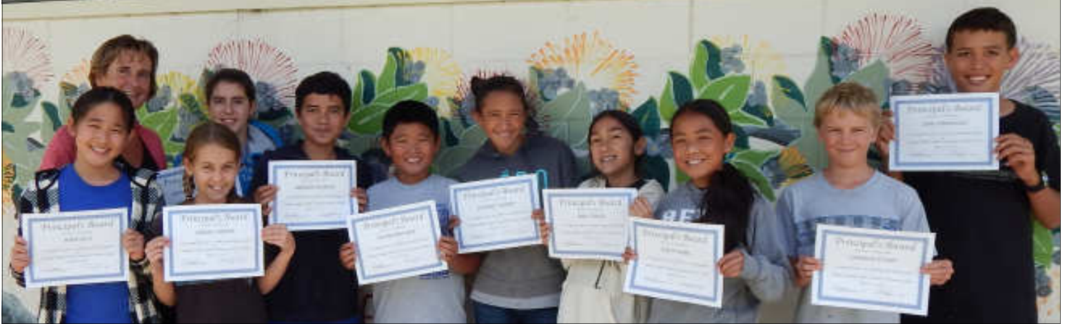
Principal's Award - 4.0!