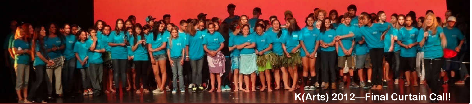
K(Arts) 2012—Final Curtain Call!

5:30 p.m., Wed., Nov. 20. Free and all invited for what is a highlight of the school year with nearly 90 students sharing what they've learned in classes — from Hip Hop, Kahiko Hula and Chanting and Tahitian , to Acting and Musical Theatre, Backstage Production and Art! Doors will open at 5 p.m. and YES—cameras are permitted!