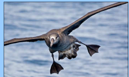
The migration pattern of the Black Footed Albatross' signals the start of the Makahiki.