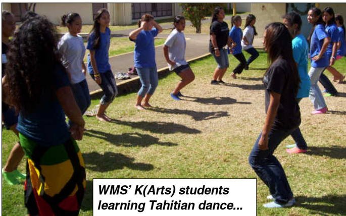
WMS' K(Arts) students learning Tahitian dance...