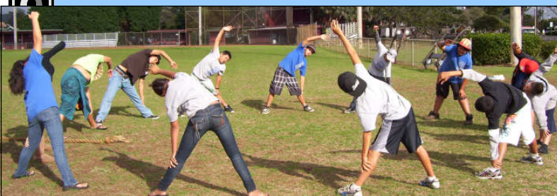
WMS Students working out at Makahiki practice...